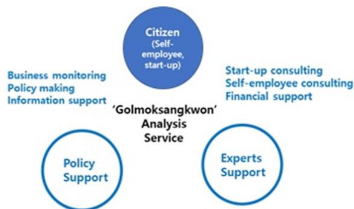
Figure 3. Local Business Support Structure (SMG, 2017)

In SMG, we are monitoring potential merchants and alleged self-employed businessmen, as well as information related to the trade.