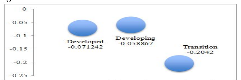
Figure 3: Country Group Coefficients by Stage of Development

Figures 1 and 2 show the FDI coefficients for each stage of economic development. Figure 3 shows country group coefficient averages by their stage of development. The results from these figures show that, in general, FDI seems to have a more stabilizing effect politically in developed countries compared to developing countries, and FDI in transition economies tends to have the biggest stabilizing effect. However, as noted, the transition economy group in the sample under study consists of only Russia. The outlier in the developed country category (Figure 1) is Germany, which is highly developed and FDI has been very stabilizing. The outlier in the developing category (Figure 2) is Chile that has been receiving plenty of FDI recently and creating a politically stabilizing situation. Regarding positive FDI coefficients, there are only 2 developed countries, 3 developing countries and 0 transition countries. So, that it was difficult to draw any general conclusions based on development stage.